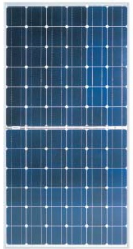
BP 7175S scale 1:14

Laminates classified by Underwriter's Laboratories for electrical and fire safety (Class C fire rating)