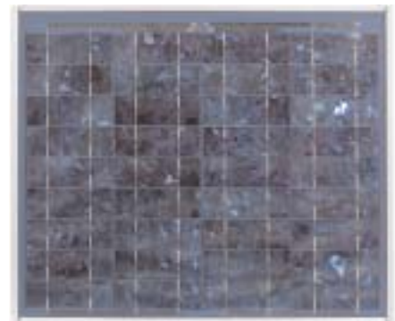
BP SX 20U scale 1:9

Approved by Factory Mutual Research for application in NEC Class 1, Division 2, Groups C & D hazardous locations, and rated for use in systems up to 600V (BP SX 20U)