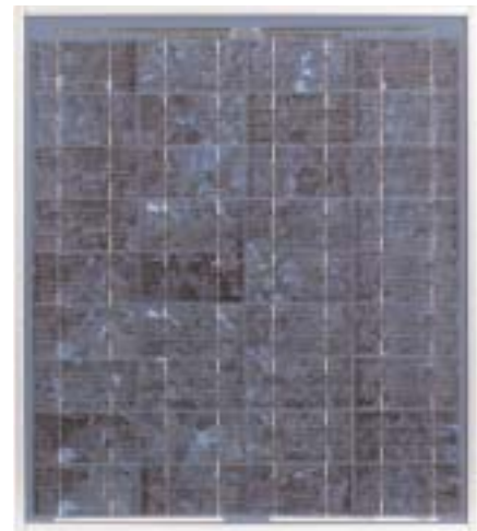
BP SX 30U scale 1:9

Approved by Factory Mutual Research for application in NEC Class 1, Division 2, Groups C & D hazardous locations, and rated for use in systems up to 48V